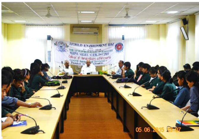
Dignitaries and NSS volunteers on the occasion of World Environment Day

of Horticulture and Forestry (CHF), Pasighat celebrated World Environment Day on 5 th June, 2015 with the theme “Seven billion dreams, one