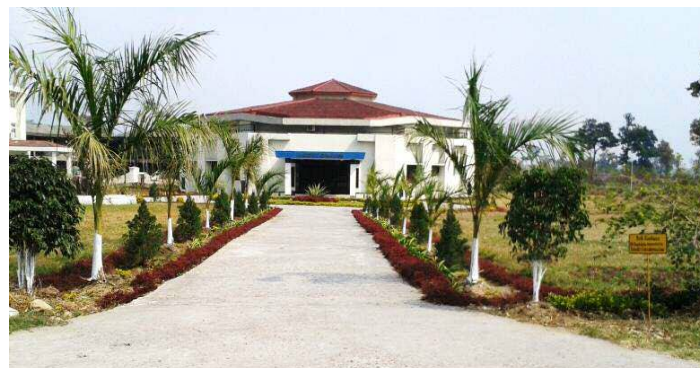
Auditorium, CHF, CAU, Pasighat