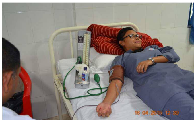
A student donating blood