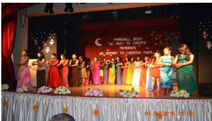
A scene of farewell function

A grandeur function was organized on 1 st May, 2015