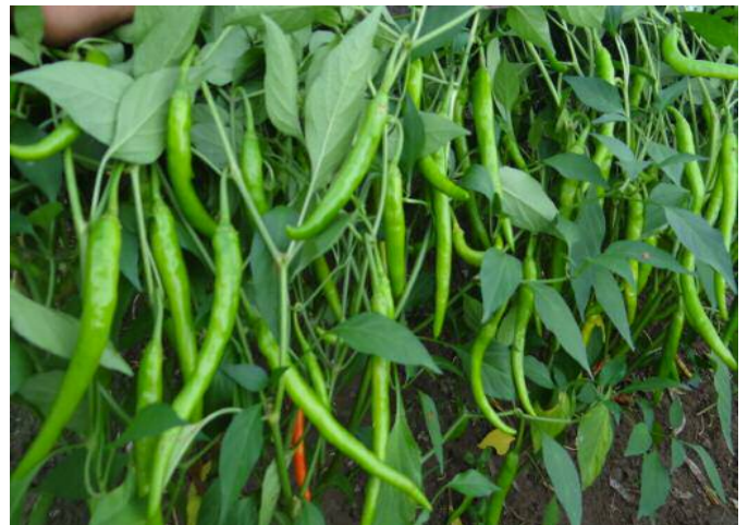
Crop of chilli

The Department of Vegetable science, have explored the possibility of cultivation of pre- Kharif chillies as a substitute crop for replacement of paddy, since the farmers of the region follow the rainfed cultivation during Kharif season and other low value crops. The findings of the experiments showed that if the transplanting of chilli is done during March- April, in that case it is possible to harvest green chilli from mid of July to September. The yield of pre- Kharif chilli may go up to 150-200 q/ha with the production