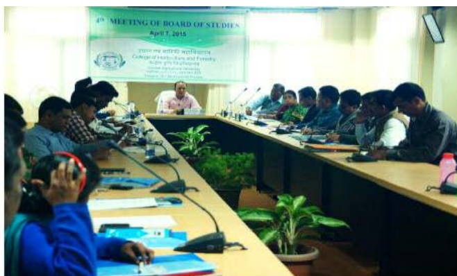
Dignitaries and Participants of Board of Studies