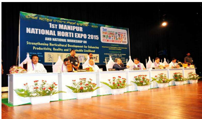
Inaugural ceremony of National Horti. Expo cum Workshop at Imphal, Manipur