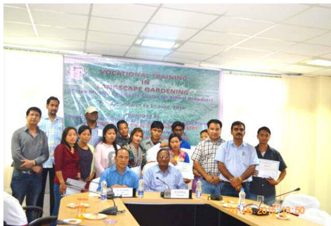
Dignitaries and participants during valedictory function of Vocational Training on Landscape Gardening

University. Altogether 10 youths from different parts of the state took part in the training programme. The main objective of training was to provide knowledge regarding the practical aspects of ornamental gardening and landscaping. Addressing during the valedictory function, Dr A.N. Maurya, Ex-Director,